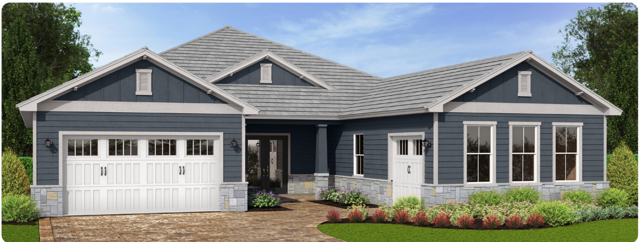
UPGRADED ELEVATION B