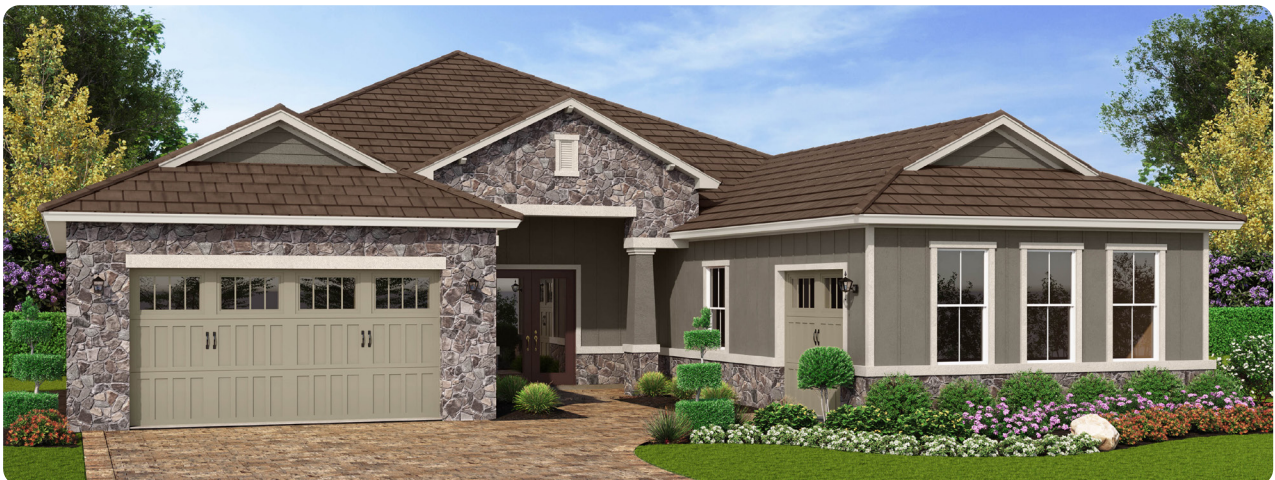
UPGRADED ELEVATION C