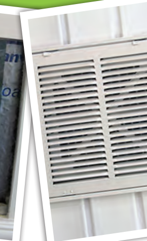
Fresh Air Intake

Exterior walls insulated with foam around electrical outlets to prevent moisture and air intrusion.