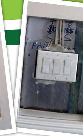
Insulated Electrical Outlets

3/4" rigid foam board insulation on exterior walls to reduce noise and improve energy efficiency.