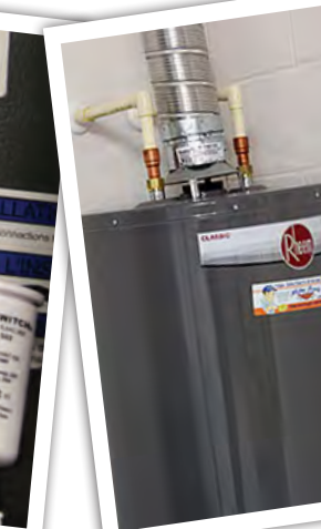
50-Gallon Natural Gas Water Heater

15+ SEER2 HVAC system with condensate overflow safety switch to avoid water damage and PVC fresh air intake and exhaust to exterior.