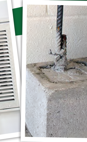
Reinforced Concrete Block

Fresh air intake for whole house fresh air exchange for improved air quality throughout house.