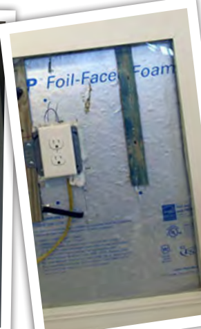
Treated Furring Strips

Low-E glass insulated double pane, single hung, argon gas filled, vinyl framed windows to reduce utility costs.