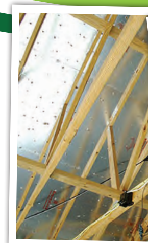
Reflective Radiant Barrier

Reflective radiant barrier on roof sheathing for maximum sun and heat protection.