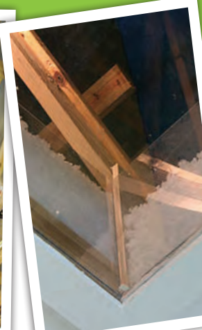
R-30 Blown Insulation

Reflective radiant barrier on roof sheathing for maximum sun and heat protection.