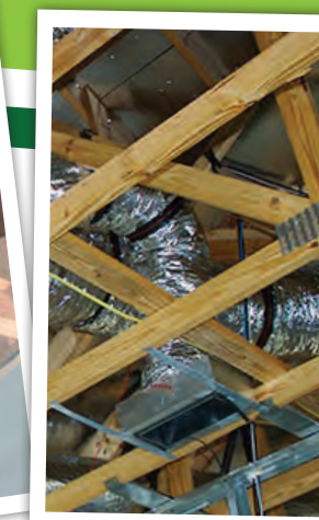
A/C Hanging Strap

R-30 blown insulation helps reduce energy costs.