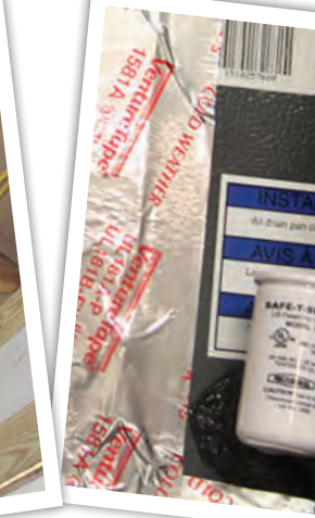
15+ SEER2 HVAC System

Baffles prevent insulation from restricting air movement reducing utility costs.