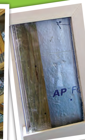
Insulated Exterior Walls

Air conditioning supply line hanging straps keeps ducts off bottom truss cords and help to ensure proper air flow.