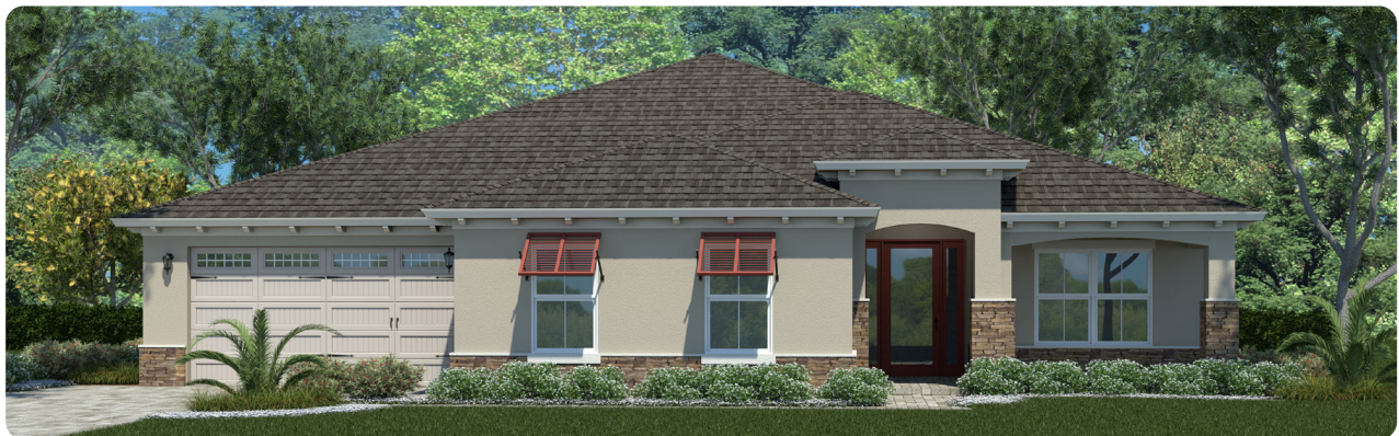
UPGRADED ELEVATION F