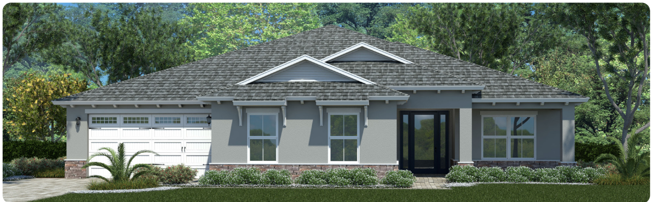
UPGRADED ELEVATION E