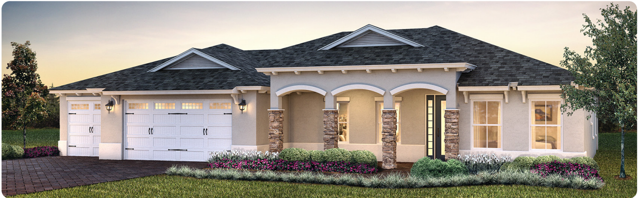
UPGRADED ELEVATION E