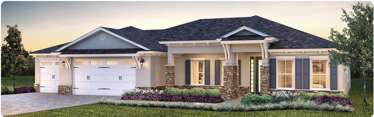
UPGRADED ELEVATION F