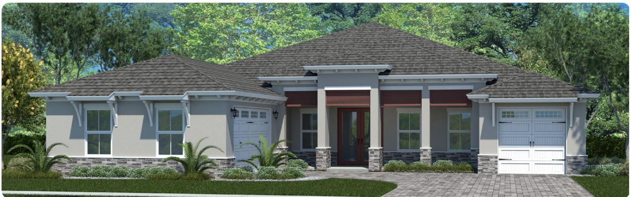
UPGRADED ELEVATION F