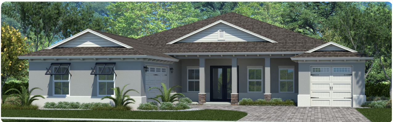
UPGRADED ELEVATION E