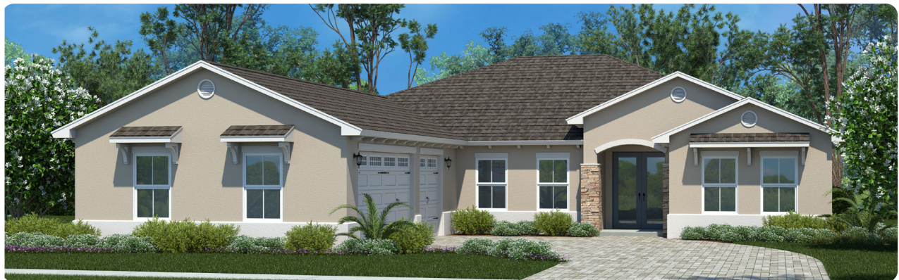
UPGRADED ELEVATION E