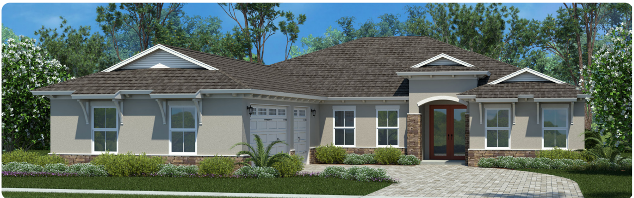
UPGRADED ELEVATION F