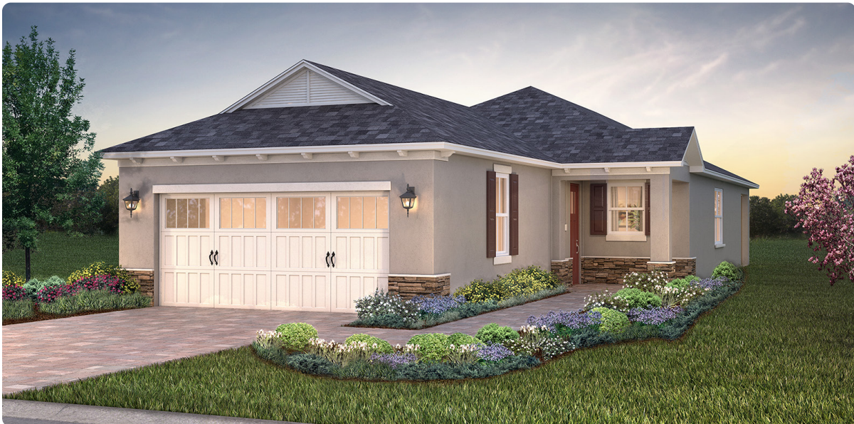
UPGRADED ELEVATION D