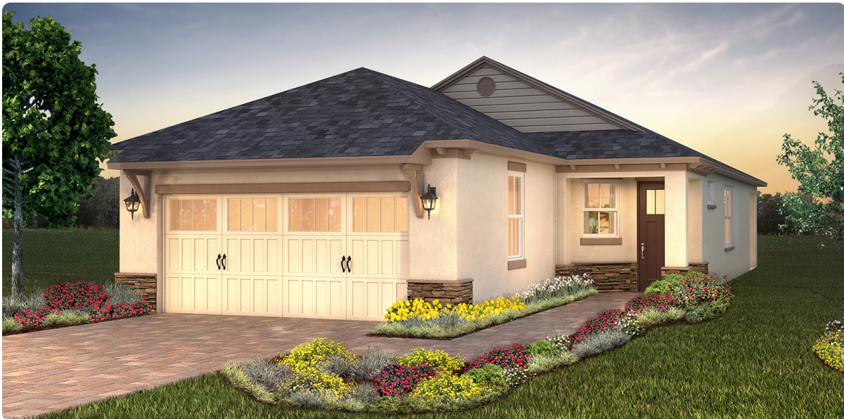
UPGRADED ELEVATION D