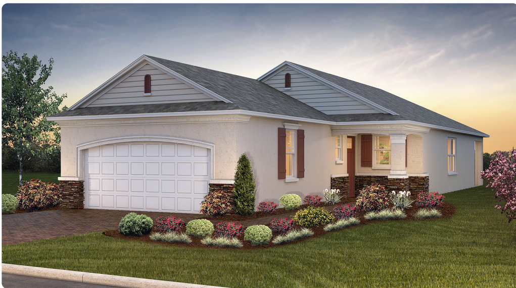
UPGRADED ELEVATION B