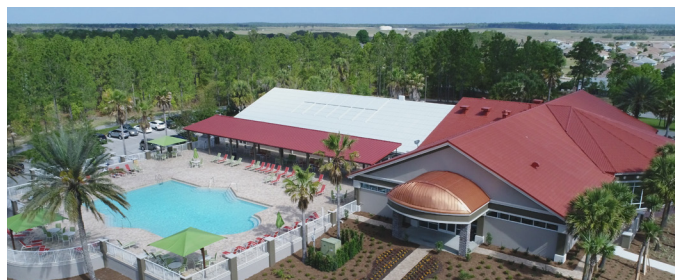
Arbor Fitness Center