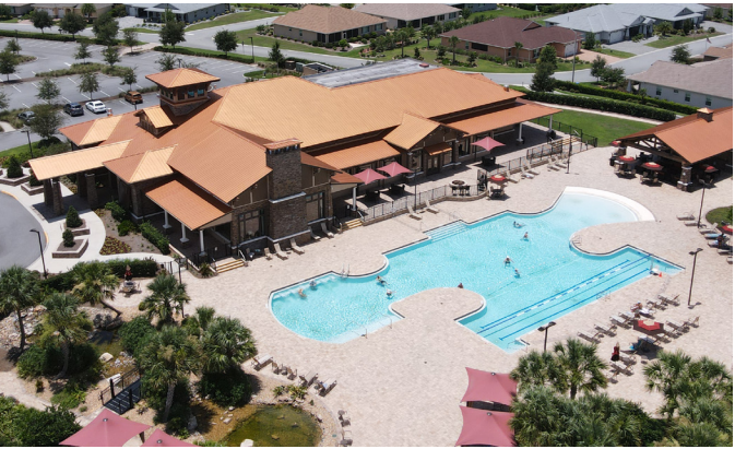
The Lodge at Candler Hills

and the 18-hole Tortoise & The Hare course was completed in 1996. Candler Hills Golf Club, a semi-private, Par 72-course opened in 2005 and is home to the annual Ocala Open golf tournament, which benefits local charities and brings renowned golfers to play the beautiful championship course. In 2002, the Arbor Club and Conference Center was completed and included an outdoor pool, a heated indoor pool with retractable roof and a tennis center with lit courts. In 2017, a renovation and refocus began to create an additional fitness facility for homewoners now called the Arbor Fitness Center.