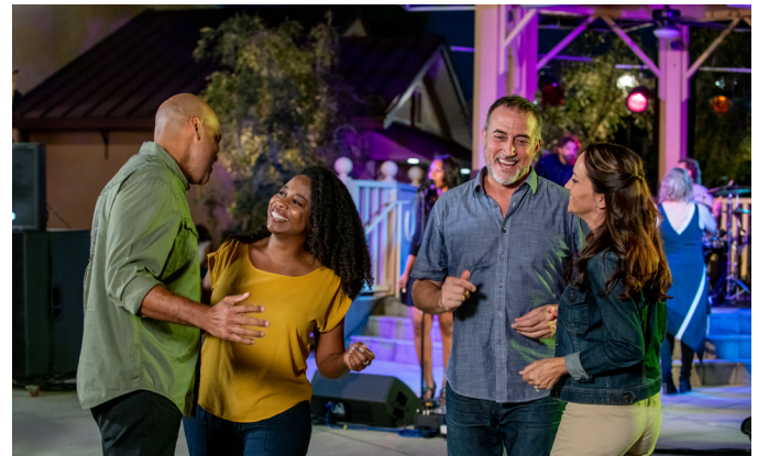
Circle Square Commons