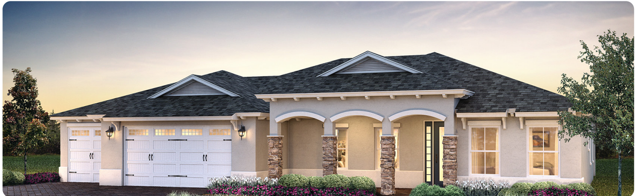
UPGRADED ELEVATION E