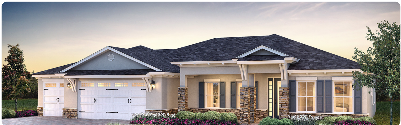
UPGRADED ELEVATION F