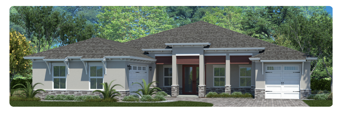
UPGRADED ELEVATION F