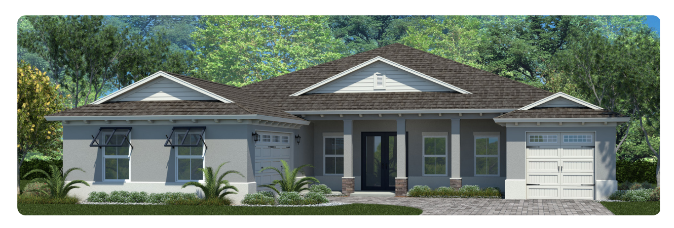
UPGRADED ELEVATION E