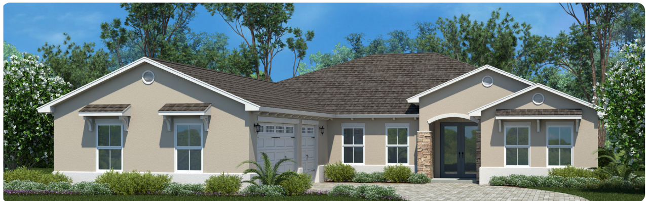
UPGRADED ELEVATION E