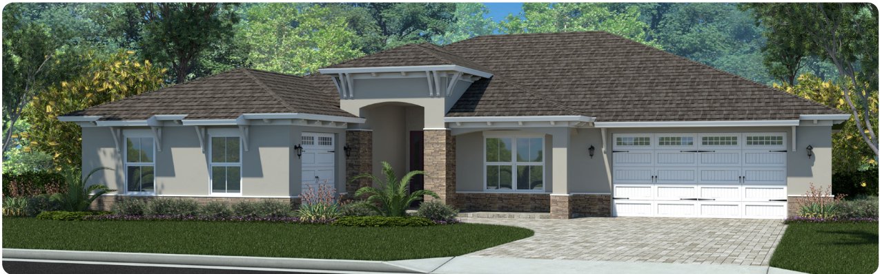
UPGRADED ELEVATION F