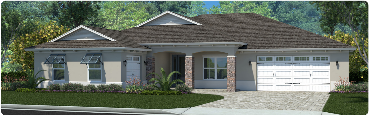
UPGRADED ELEVATION E