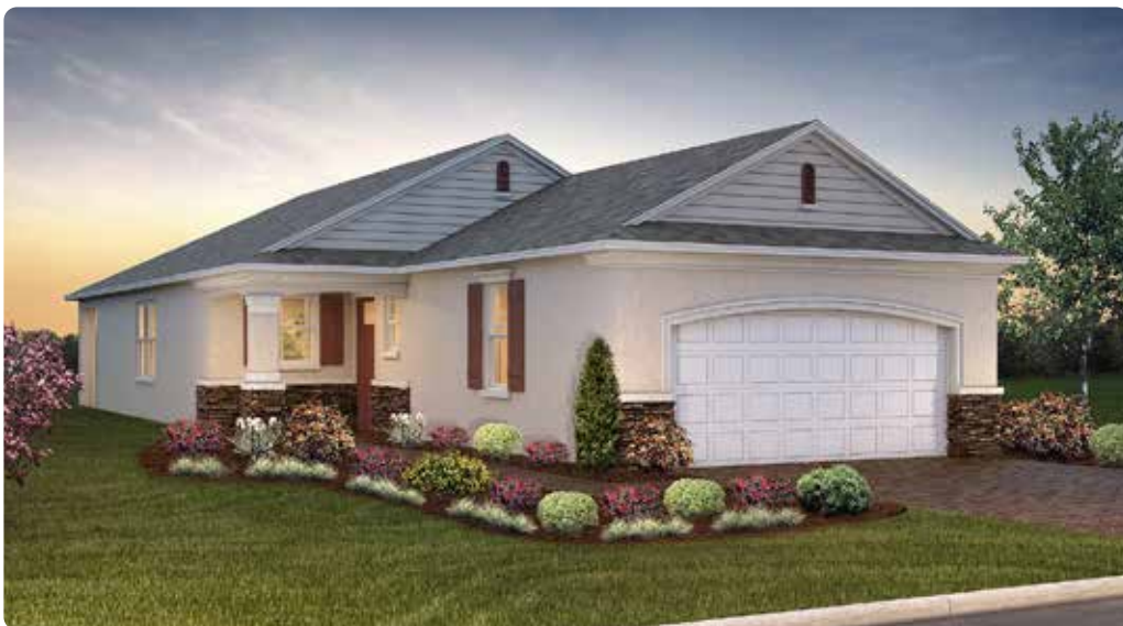
UPGRADED ELEVATION B