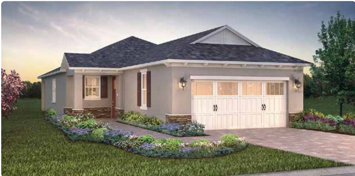
UPGRADED ELEVATION D