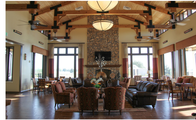
The Lodge at Candler Hills

construction on the next phase was to begin in 1996, the emphasis shifted to single-family homes built of concrete block and steel construction.