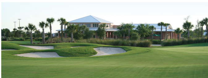
Candler Hills Golf Course

On Top of the World continues to develop and grow and has launched 25 new models since 2014 in five neighborhoods. These models vary from the Classic Series in the Indigo East neighborhood, Premier Series in Meridian Preserve and Estate Series in Candler Hills. These neighborhoods are designed to offer a healthy and rewarding lifestyle for residents by providing many different and unique amenities, such as a series of swimming pools, championship golf courses, restaurants, walking trails and so much more. In fact, we have over 300,000 square feet of indoor amenities, over 181 acres of outdoor amenities and 16 different walking trails.