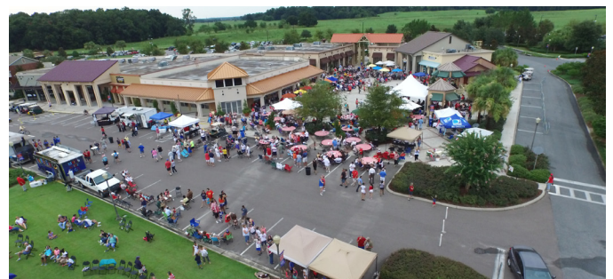
Circle Square Commons